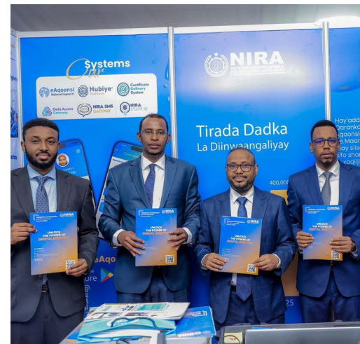
WORLD ID DAY